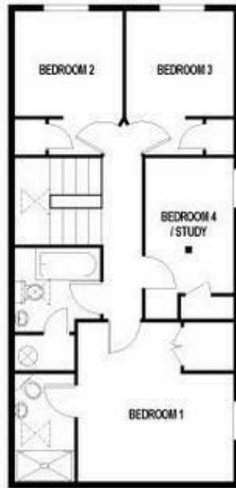
FIRST FLOOR GROSS INTERNAL FLOOR AREA APPROX. 648 SQ FT / 60 SQ M